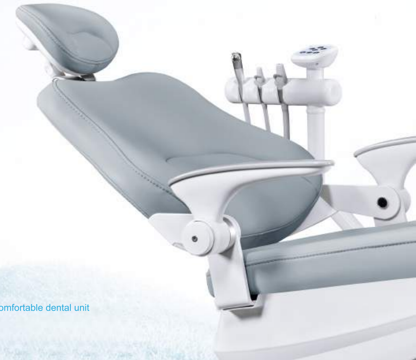
Comfortable dental unit